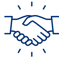
Directors & Officers